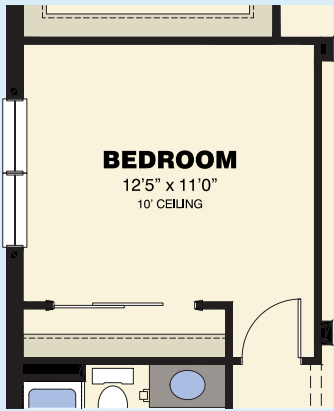
AVAILABLE BEDROOM 3 VARIATION